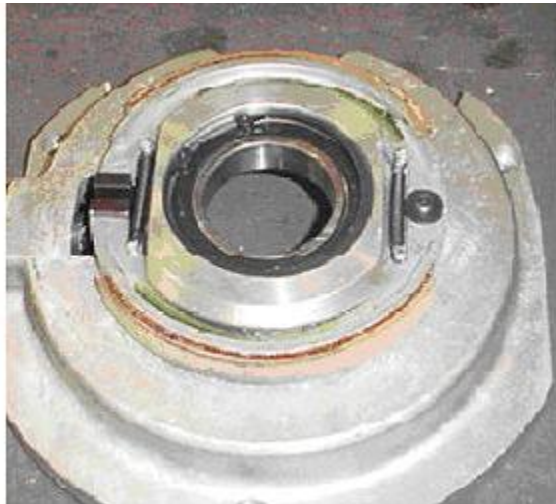
Remove snap ring and take off stationary driven varidisc to see brake shoe