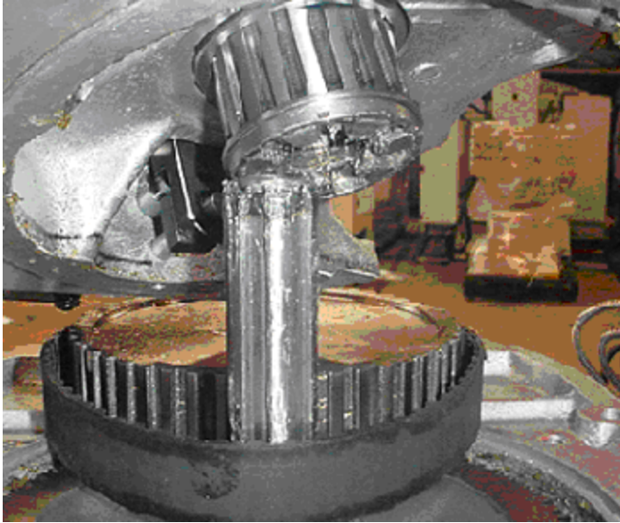
Remove belt housing base. Brake shoe inside the belt housing base