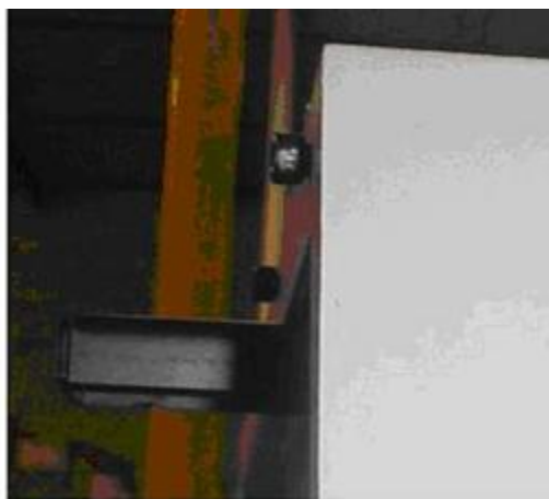
After adjusting side way to right position