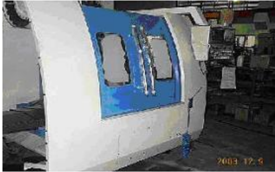
Remove the side cover 's screws from full enclosure