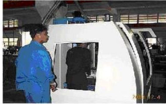
Move the side cover next to the side of full enclosure