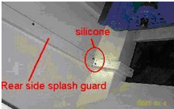
Tighten screws of crack cover which is between side cover & main cover