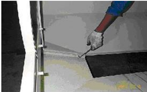
Tighten screws from front and below side first