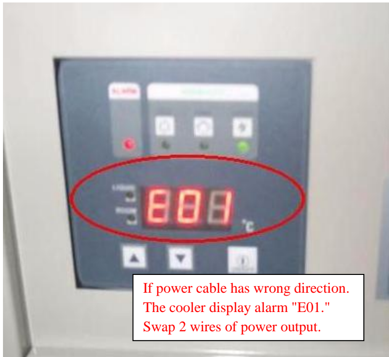
If power cable has wrong direction. The cooler display alarm "E01." Swap 2 wires of power output.