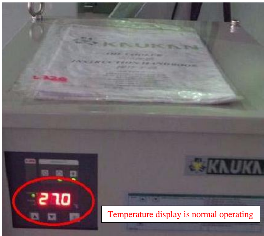
Temperature display is normal operating